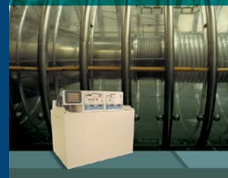
Advanced RF Systems